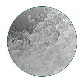
FLAKED ICE Inexpensive to produce, used in produce and fish displays.